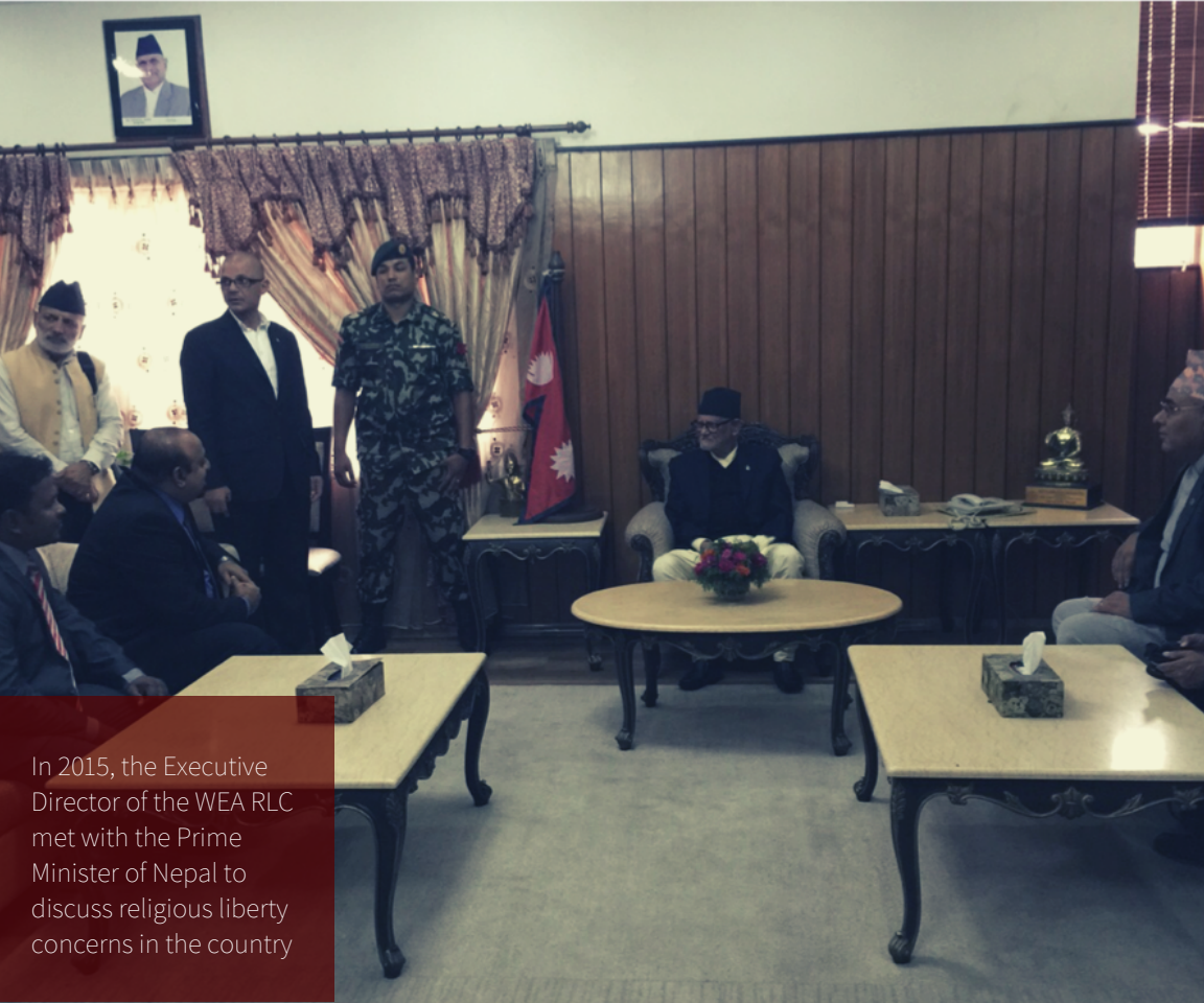
In 2015, the Executive Director of the WEA RLC met with the Prime Minister of Nepal to discuss religious liberty concerns in the country