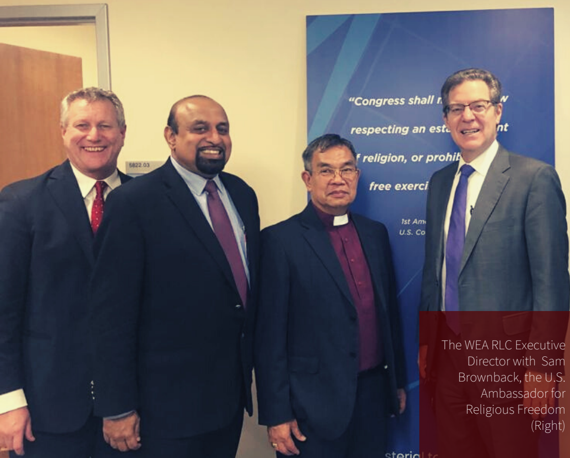
The WEA RLC Executive Director with Sam Brownback, the U.S. Ambassador for Religious Freedom (Right)