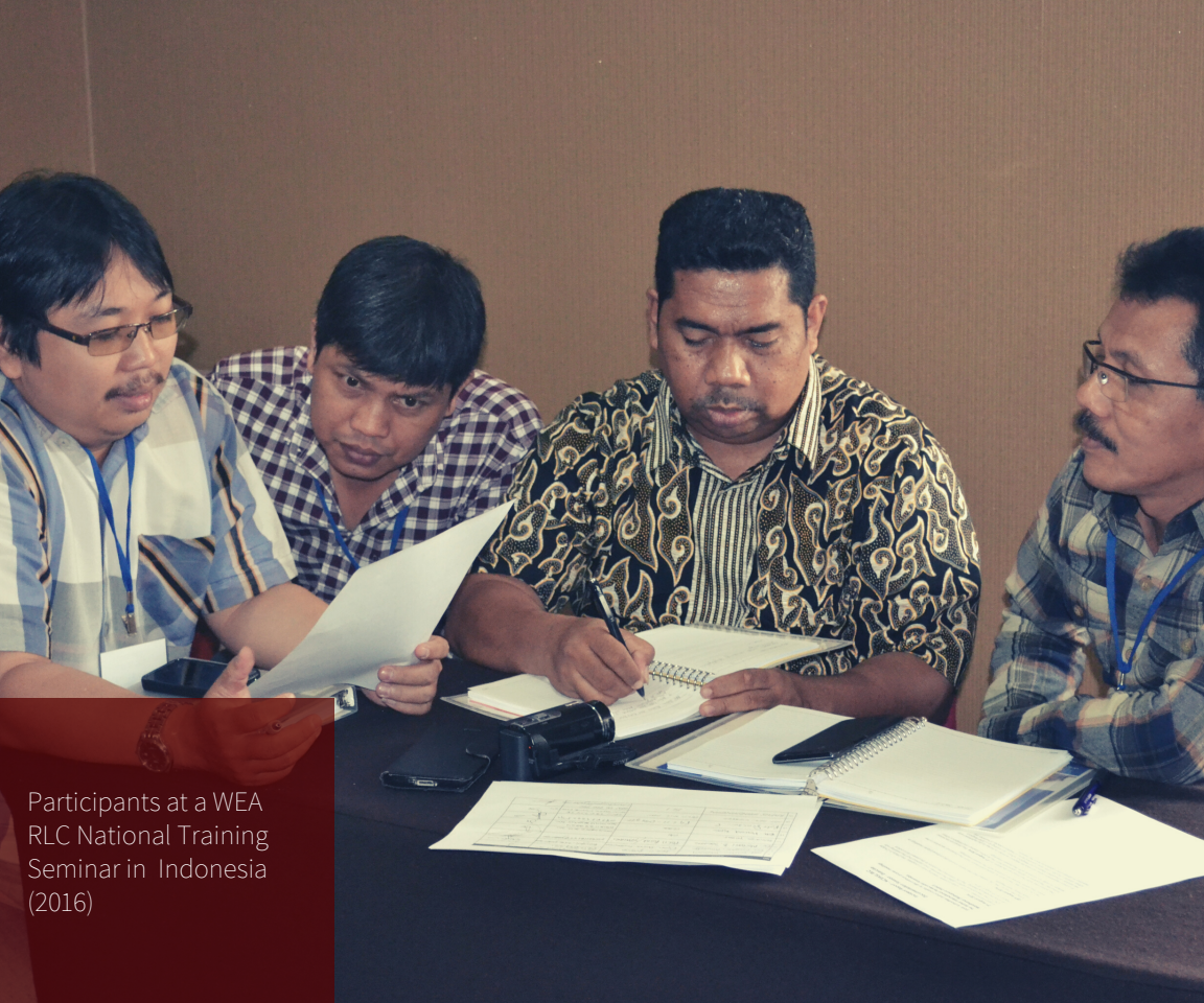
Participants at a WEA RLC National Training Seminar in Indonesia (2016)